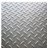
M.S. Checker Plate