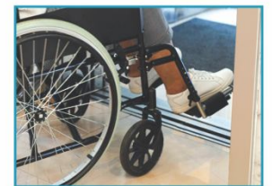
VVVF control makes The lift run more stable And quiet