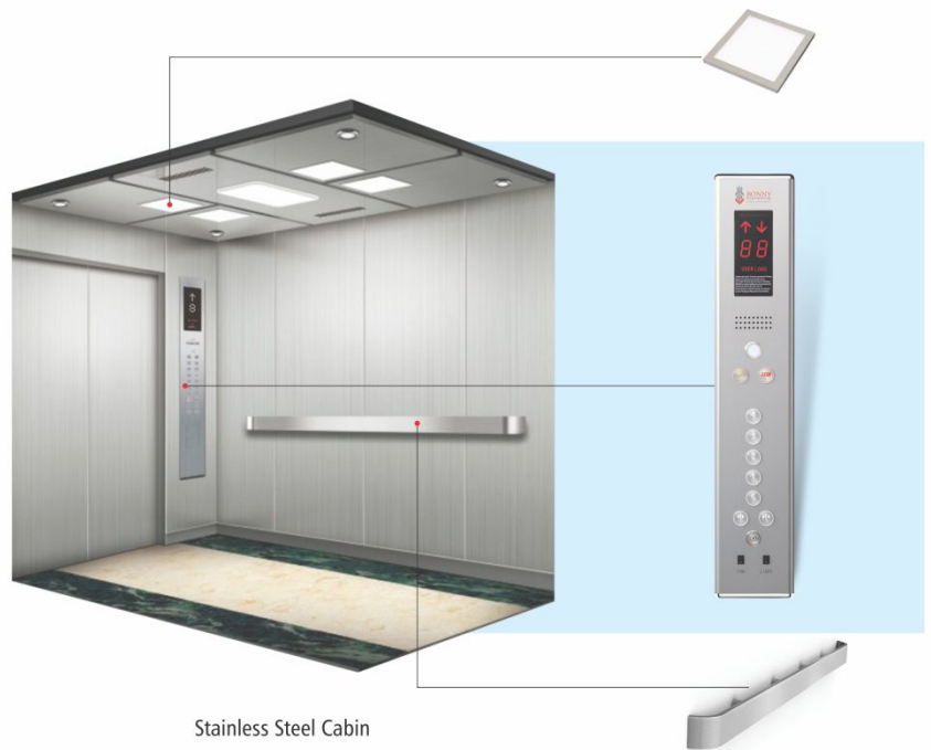
Stainless Steel Cabin