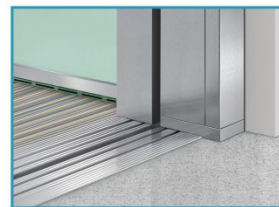
Maximum opening of the door Satisfies the need of Freely access of bed