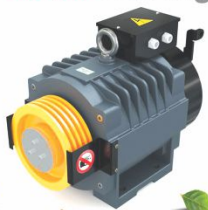
Mini Gearless Machine